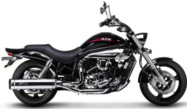
650 V-TWIN CRUISER