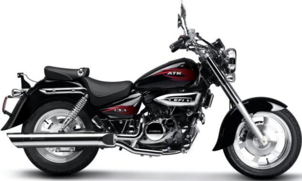
250 V-TWIN CRUISER