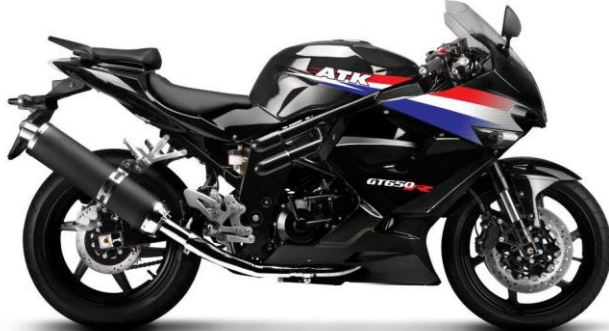
650 V-TWIN SPORT