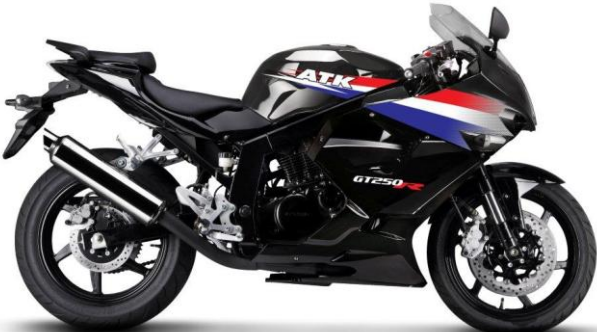
250 V-TWIN SPORT